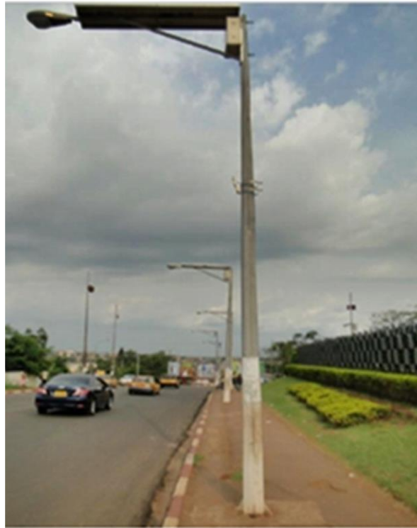
Figure 1: Solar PV utilization, solar powering streets in Yaoundé-Cameroon (Wirba et al., 2015)

in taking important steps to boost the sector. It is not widely used across Cameroon with only 50 PV installations currently exist. In most part of the country, the mean solar irradiance is approximately 5.8 kWh/m 2 /day (LAUS, 2012). Solar power is mostly used for powering the cellular telecommunications network and street lights in many parts of the country (see fig. 1).