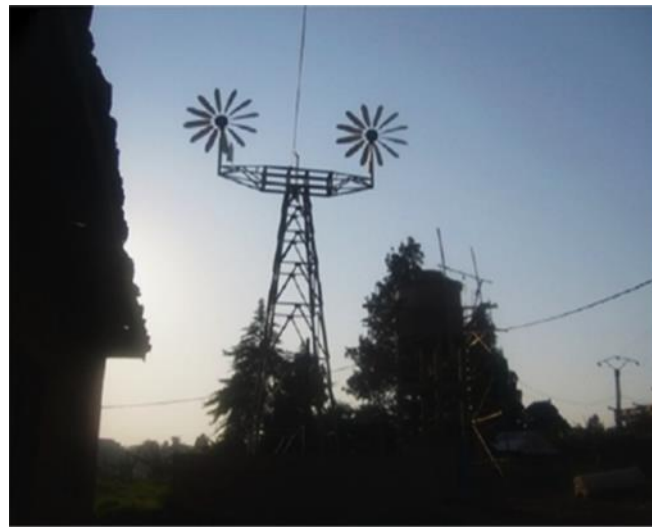
Figure 2: Wind electric pumping system at Ndoh Djutissa in Cameroon (Nfah and Ngundam, 2012)

those potential power stations are developed, in order to serve energy to both the rural and the urban dwellers of Cameroon.